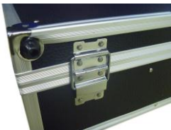
Reinforce Construction Hinges and Corner Protector

At the end of the course, the student uses the step-by-step illustrate destructions in the Experiment Manual to disassemble the trainer and prepare it for the next class